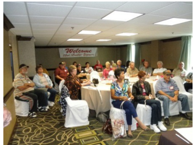
"Get your dollar ready"