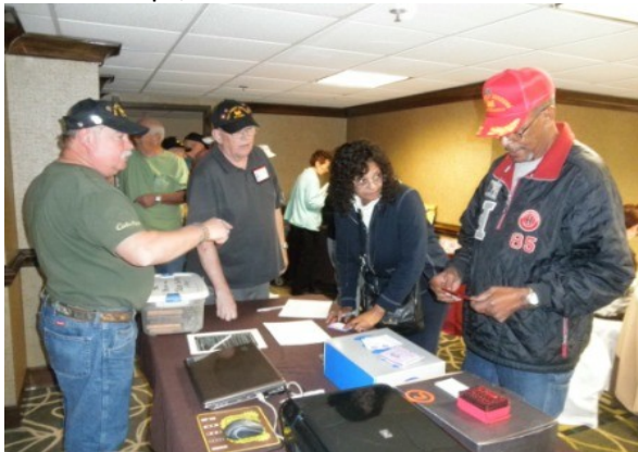
"Do I write my name on the name tag?"

2014 Reunion will be held in Branson, MO. – more details on page 5.