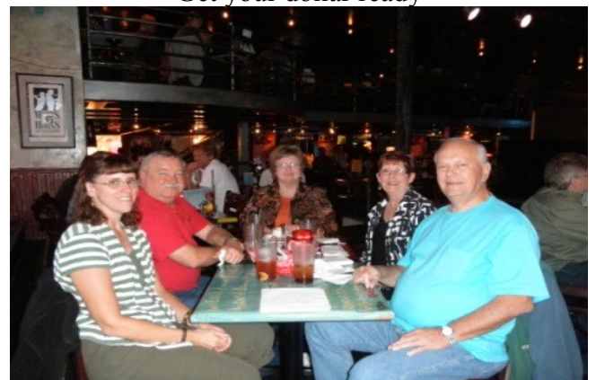
Friendship and food at BB King's 2012 82 nd Engineers Business Meeting Minutes