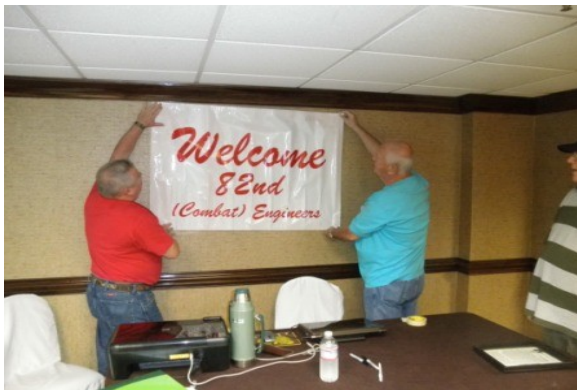
Getting ready for the troops "Oops, who has the thumb tacks?"

Well, the 2012 reunion is in the books. Memphis was an experience I'm sure all will remember. But, I've come to the realization that it's not where you're at, the city or the building, but it's the people that you are with. It was like coming home to family and realizing that the time we are able to spend with each other is really the only thing that matters. We hope everyone had a good time and enjoyed all the great Memphis BBQ's. We look forward to seeing everyone at the next reunion (2014-in Branson, MO) !