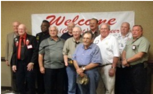
2012 Reunion attendees